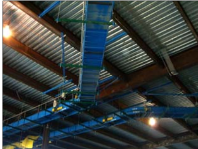
Part of the intricate conveyer system at the Indianapolis Airport