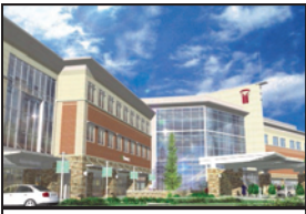
Clarian Saxony Rendering

To keep ERMCO strong and competitive in the marketplace, there have been some changes made in the management staff to better utilize the talent that is available and to ensure that the company is properly organized to provide new opportunities and new experiences for the ERMCO team members.