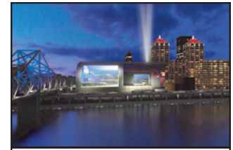
Louisville Arena Rendering