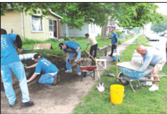
ERMCO volunteers build retaining wall at Rebuilding Together 2010

2010 marked the 11 th year for Rebuilding Together Indianapolis and, once again, ERMCO and our team members played a key role in the event's success. Rebuilding Together is a national organization that renovates homes for elderly, disabled and low-income home owners, revitalizing neighborhoods and creating an atmosphere of sharing and caring. Since 1999, the Indianapolis affiliate has renovated approximately 250 homes in 10 separate neighborhoods, along with other community projects. This year, over 500 volunteers worked on 24 homes in the Haughville neighborhood on the near west side of Indy.