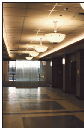
Interior Hallway at Union Hospital